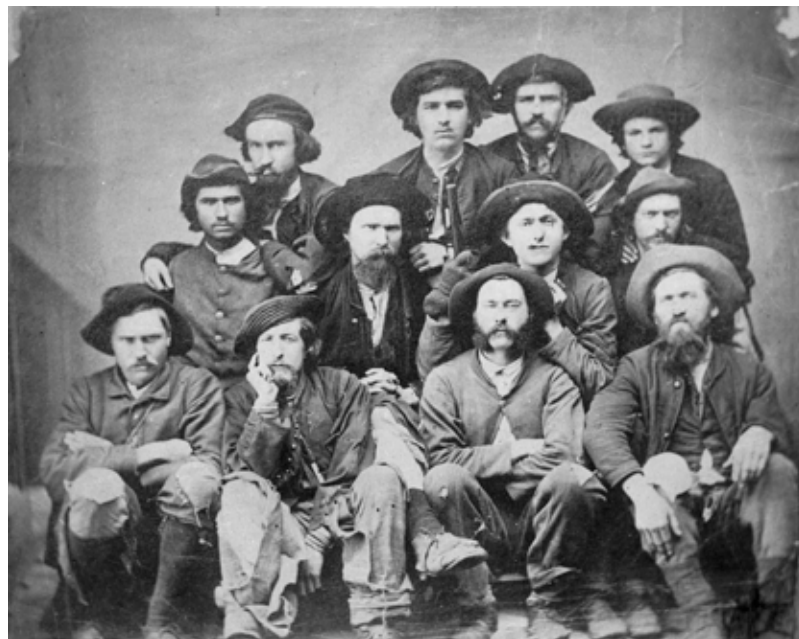
Captured Morgan’s Raiders

July 4, 1864 – Reconstruction Controversy. July 8 – Reconstruction Proclamation and backing of constitutional amendment abolishing slavery. July 9 – Battle of Monocacy MD. July 11 – Confederates invade Washington suburbs (Silver Spring MD). July 12 - Confederates withdraw from Washington. July 14 – Battle of Tupelo or Harrisburg MS. July 17 – Hood replaces Johnston in GA. July 20 – Battle of Peachtree Creek GA. July 22 – Battle of Atlanta. July 24 – Second Battle of Kernstown VA. July 28 – Battle of Ezra Church GA. July 30 – Petersburg Mine Explosion and Assault; Capture of Chambersburg PA.