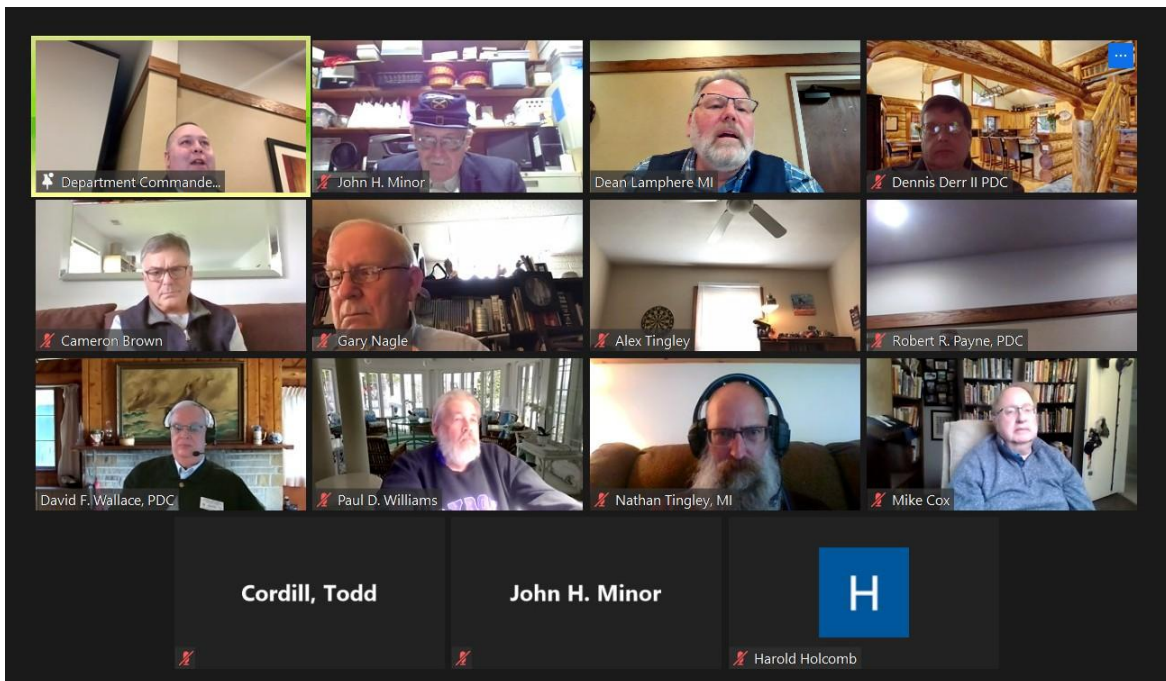
Brothers attending the Encampment virtually