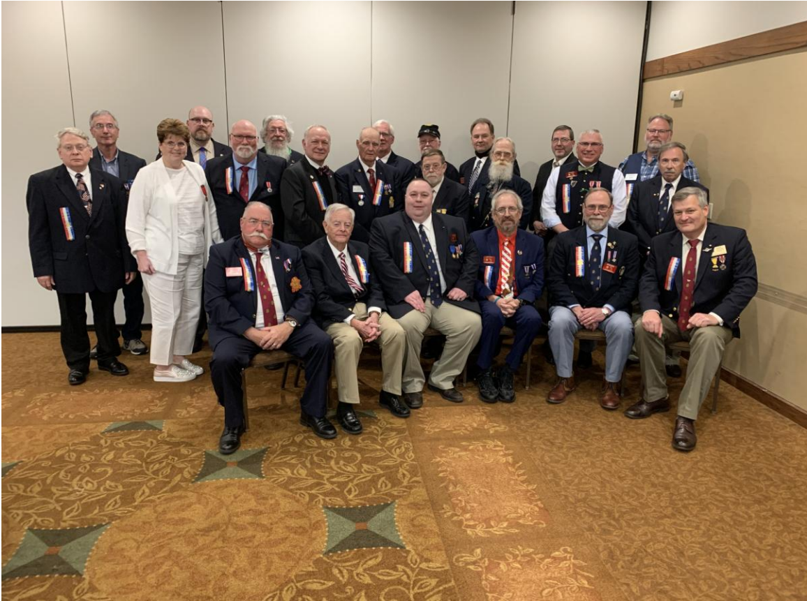
Brothers attending the Encampment in person